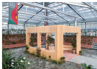
Relaxation space surrounded by camellia

In addition to the Nonoichi species, approximately 700 carefully selected camellia, from about 300 varieties of Japanese and foreign species are on display. Inside, a tree name board gives information on the camellia exhibited including the category name, flower color, shape, size, flowering season, production area, features, and flowering photos. Here we can enjoy camellia grown nationwide by camellia enthusiasts.