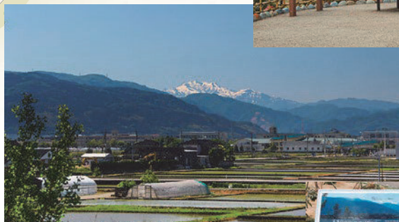
View of Hakusan from the summit "Hakusan View Spot"