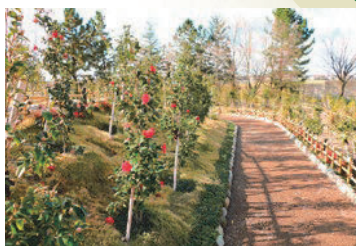
A wide variety of camellia bloom along the in garden path.