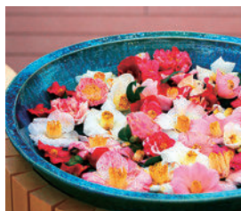
A water pot of colorful camellia