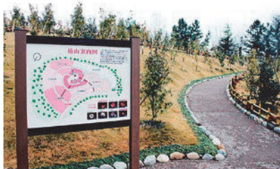
Tsubakiyama guide signboard

There are small manmade hills in the southwest corner of Nonoichi central park. On these, many camellia bloom alongside the garden paths. There are about 200 varieties and about 800 camellias, with both foreign and Japanese species, including the Nonoichi species. Enjoy viewing them all in one place, including on the north slope of TSUBAKI YAMA. Also from the top of the hill, if the weather is good, the sacred Hakusan mountain can be seen. The city has installed Hakusan View Spot signs and benches.