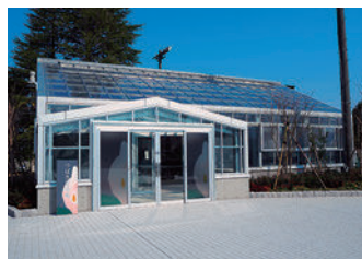
Adjacent camellia cultivation facility