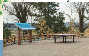
Top of Tsubakiyama